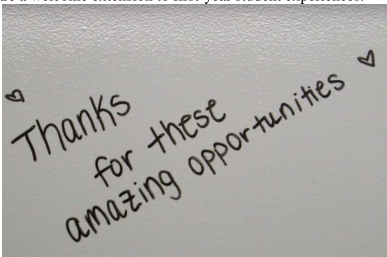
Figure 4. Sample Informal Use of Makerspace. Messages from students are often left on the dry-erase walls in the makerspace.

Of all the successes, one notable realization is the repeated appreciation for the makerspace. The volunteers shared they appreciate the community aspect of the makerspace. One student noted the LLC makerspace introduced her to friends who will also be her life-long colleagues because they are all entering the teaching profession. Another left a note on the dry-erase wall, “Thanks for these amazing opportunities” (See Figure 4). The appreciation and willingness to help without the work being tied to course credit is a strong indication this LLC makerspace and its activities are a welcome extension to first-year student experiences.